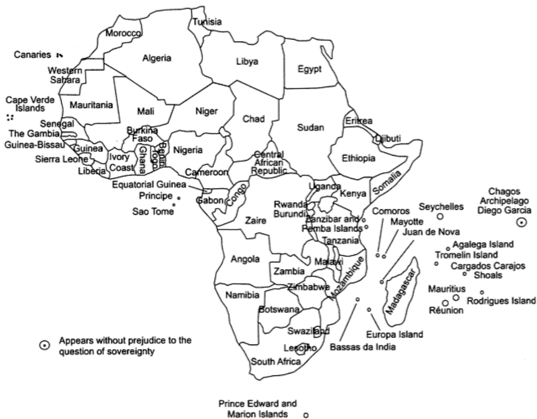
Map of an African Nuclear-Weapon-Free Zone

The African Nuclear-Weapon-Free Zone extends across the entire continent of mainland Africa, and the following islands: Agalega Island, Bassas da India, Canary Islands, Cape Verde, Cardagos Carajos Shoals, Chagos Archipelago - Diego Garcia, Comoros, Europa, Juan de Nova, Madagascar, Mauritius, Mayotte, Prince Edward & Marion Islands, Reunion, Rodrigues Island, Sao Tome and Principe, Seychelles, Tomelin Island, Zanzibar & Pemba Islands.